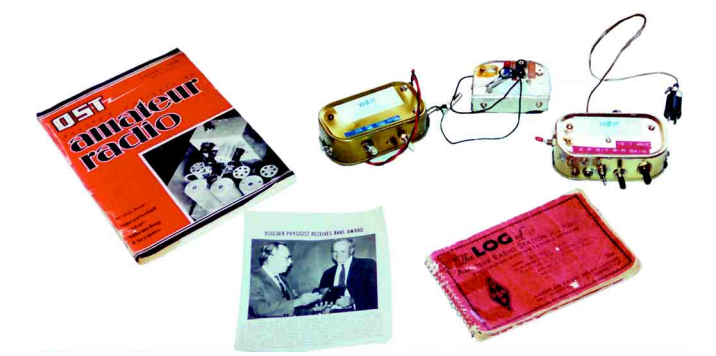
Three of WØJF's surviving Sardine Can transmitters.

Working at the National Bureau of Standards, he was involved with WWV