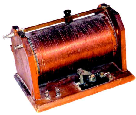
Yardley's crystal set, built in 1923 at age 9.